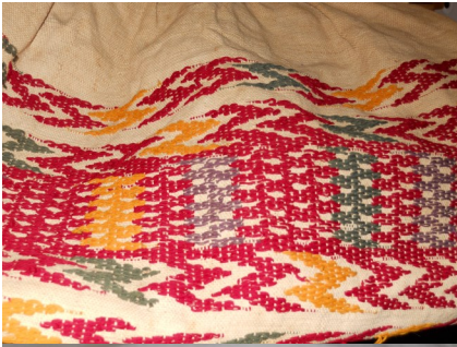
Knitting bags displayed from a private collection of Peggy Hart-NEWS 2015

Each member will receive a gift in exchange!